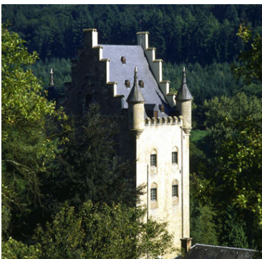
Schoenfels ( www.ont.lu )