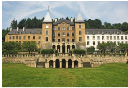
Ansembourg ( www.flickrriver.com )