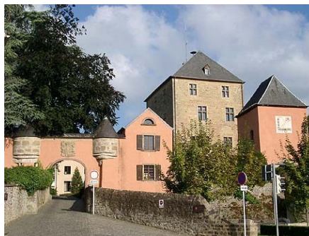
Mersch ( www.mersch.lu )