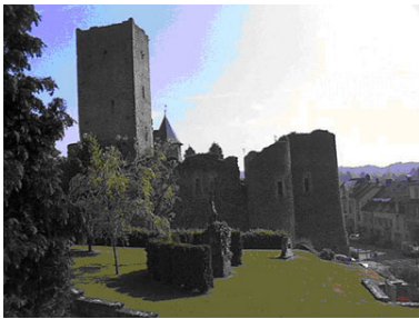
Useldange ( www.associationchateaux.lu )

Info: http://www.ont.lu/spor-nl-6-27.html