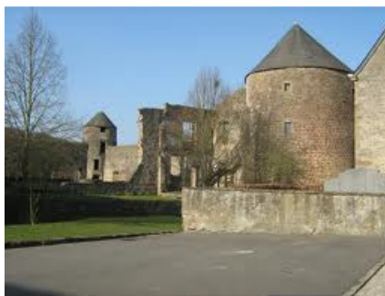
Pettingen ( www.wikipedia.org )