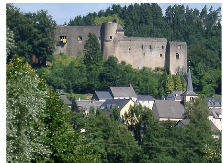
Septfontaines ( www.luxalbum.com )