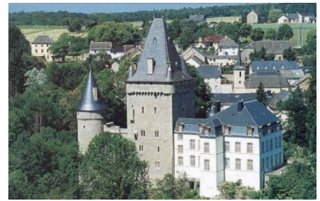
Hollenfels ( www.ssmn.public.lu )